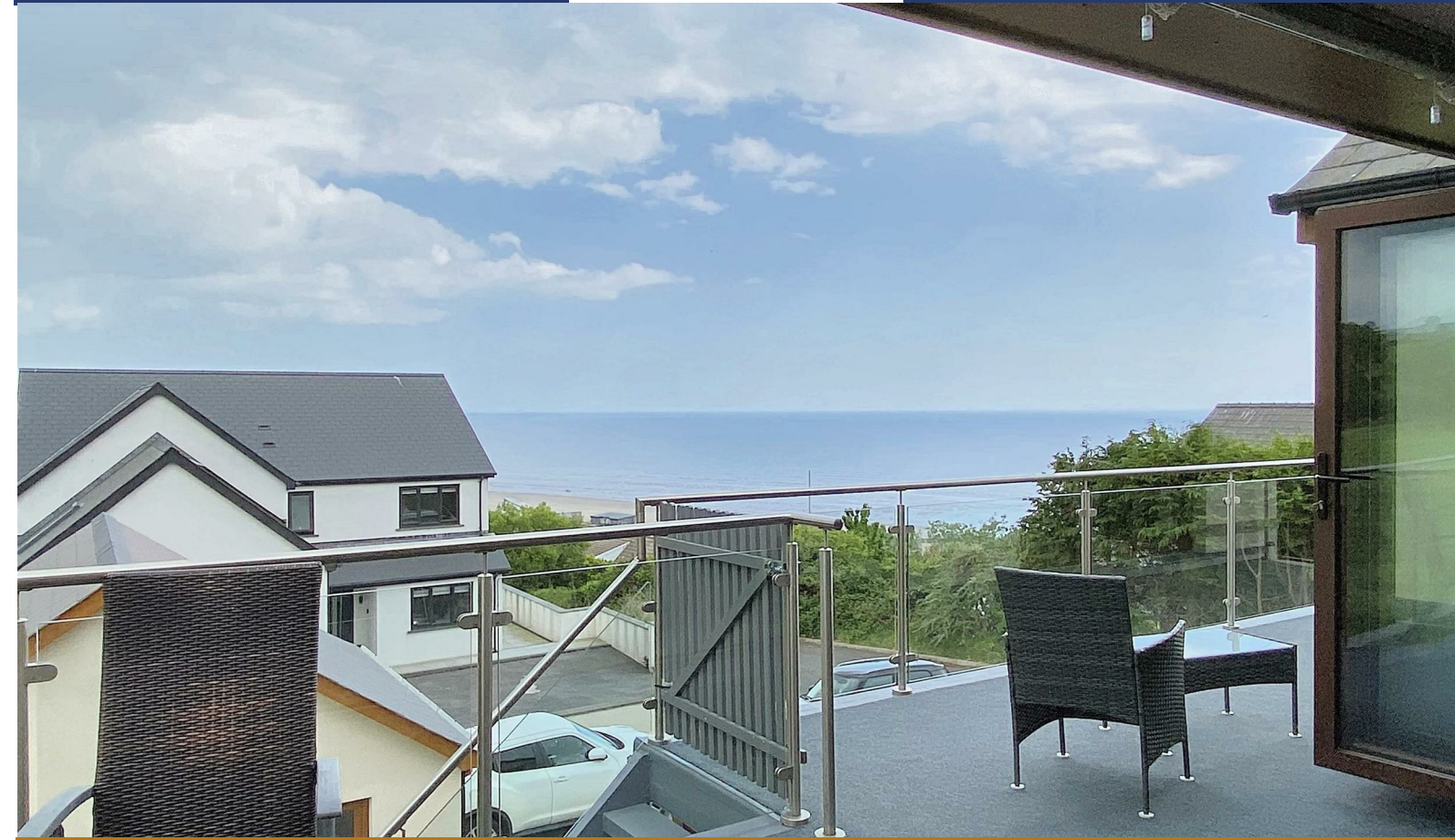
Llygad - Yr- Haul Pendine, Carmarthen, Carmarthenshire, SA33 4PD

This floorplan is only for illustrative purposes and is not to scale. Measurements of rooms, doors, windows, and any items are approximate and no responsibility is taken for any error, omission or mis-statement. Icons of items such as bathroom suites are representations only and may not look like the real items. Made with Made Snappy 360.